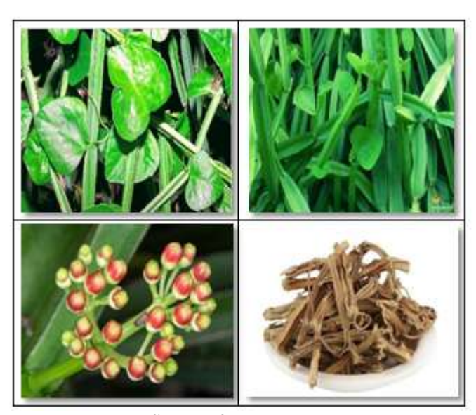
Leaves, Stem, Inflorescence, Dry stem